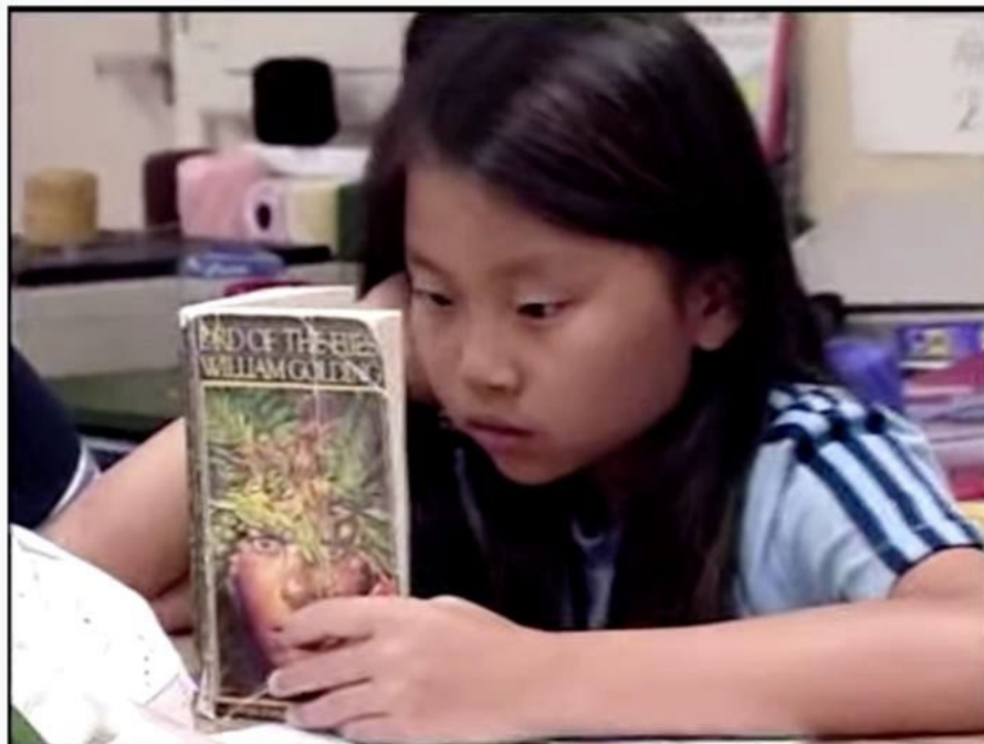
The Hobart Shakespeareans - Trailer - POV 2005 | PBS